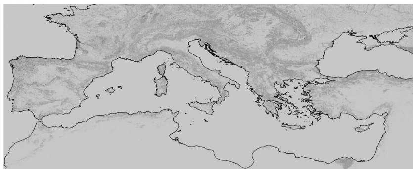
Fig. 1. Results for the Mediterranean Basin from time-series analysis of Landsat 7 ETM+ images in characterizing global forest extent and change from 2000 through 2012 (Hansen et al., 2013). Dark grey: forest cover in 2000; black: gain forest from 2000 to 2012; white: forest lost from 2000 to 2012. It is difficult to appreciate forest gain and losses due to the scattered nature of the process in the Region although lower scales could be accessed in the original webpage: http://earthenginepartners.appspot.com/science-2013-global-forest .

(Bendel et al., 2006; Retana et al., 2002). Second, the higher fire frequency and intensity in fire-prone areas might result in: (i) a decrease in the resprouting ability of plants and reduced resilience at the landscape level of forests dominated by resprouters (Díaz-Delgado et al., 2002; Marzano et al., 2012); (ii) a failure of obligate seeders regeneration when time intervals between fires are shorter than the time required for a sufficient seed bank to build up ('immaturity risk', sensu Zedler, 1995).